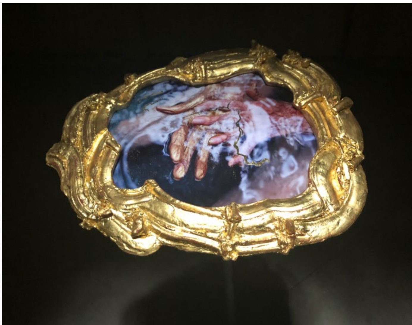
Janine Antoni "I conjure up" (2019) Mixed media gilded with 24 karat gold leaf 14 1/8 x 16 1/4 x 1 1/8 inches

Hyper-pigmented, the photographs appear almost painterly, even as their photographic accuracy challenges this possibility. Each body is captured in the midst of a gesture or movement — hands grasping the edge a ribcage, forcing the flesh of the abdomen inwards under the pressure of the grip, or a sun-spotted hand tugging an earlobe. In many of the images, the skin is smeared with dirt or gold pigment, further accentuating the texture of the dermis, its lines and folds. It seemed to me that the photos were of both younger and older figures, which Antoni confirmed included herself, her parents, and her daughter, all of which contributes to the sense that these works are fundamentally about time, and the ways in which its passage records itself on flesh.