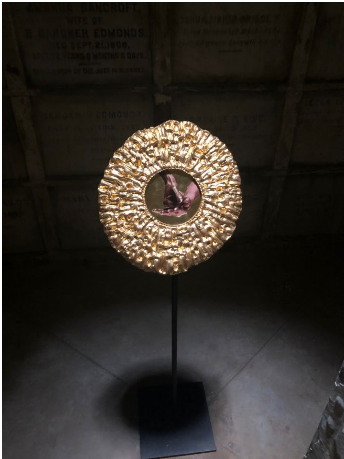
Detail, Janine Antoni "I am tool and substance" (2019) Mixed media gilded with 24 karat gold leaf