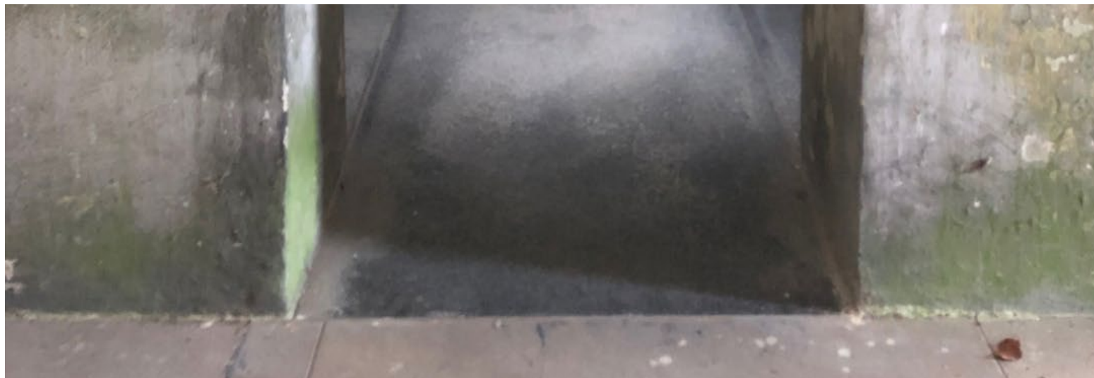
Janine Antoni "I speak up" (2019) Mixed media gilded with 24 karat gold leaf 21 x 18 1/8 x 2 3/8 inches (53.34 x 46.04 x 6.03 cm)

Amidst the daily grind of youth-obsessed culture, there is something quite literally grounding about visiting Green-Wood Cemetery. Walking its verdant, leaf-strewn paths, one appreciates New York City's history from a different vantage point, while also reconnecting with the embodied reality of being human, of our unavoidable impermanence. Within Green-Wood's catacombs, Antoni's project leaves much to contemplate simultaneously — mortality, desire, and the ways in which absence and longing are such a fundamental part of life.