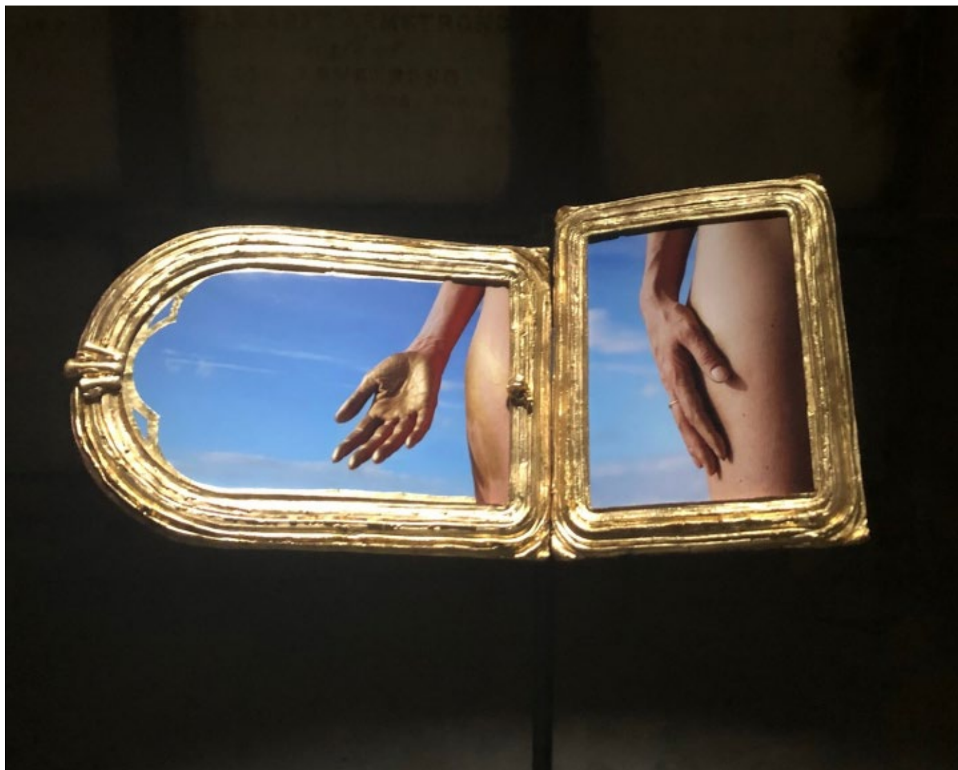
Janine Antoni "I unfold, I infold" (2019), mixed media gilded with 24 karat gold leaf Installed: 12 3/4 x 24 3/4 x 7/8 inches, flat: 12 3/4 x 28 1/4 x 7/8 inches

The catacombs of Brooklyn's historic Green-Wood Cemetery are situated at the intersection of several winding roads and paths, among the many marble markers of lives lived recently and in the deep past of our city. In the darkened hall of this narrow space, a glow emerges from the distant back wall. To the right and left are vaults, most dedicated to specific families whose dead were received long ago. These small, gloomy spaces are each lit from above, lending them a church-like feeling wherein the underworld remains touched by the light of day.