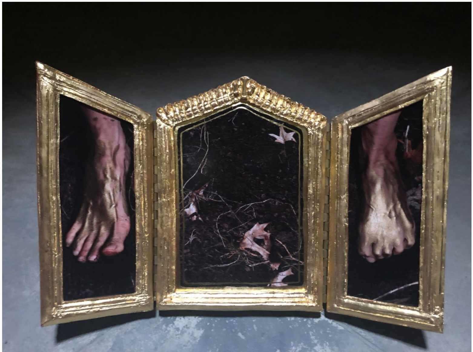
Janine Antoni "I am fertile ground" (2019) Mixed media gilded with 24 karat gold leaf Installed: 12 7/8 x 19 5/8 x 5/8 inches (32.7 x 49.85 x 1.59 cm) Flat: 12 7/8 x 20 1/8 x 5/8 inches (32.7 x 51.12 x 1.59 cm)

While the cemetery has been organizing public programs such as concerts and film screenings, as well as walking tours for over 15 years, it has only recently begun commissioning artworks by contemporary artists. Antoni's project follows one by Sophie Calle , initiated by Creative Time and co-presented with Green-Wood in 2017. Calle's Here Lie the Secrets of Green-Wood Cemetery's Visitors from 201-2042 , is a 25-year-long installation, a monument situated near the entrance to the cemetery with a slot through which visitors may slip pieces of paper inscribed with their secrets.