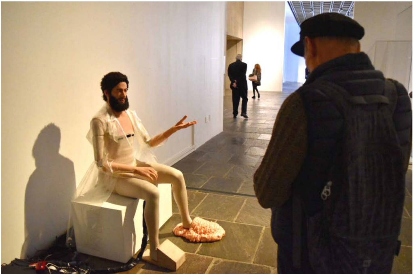
Goshka Macuga, To the Son of Man Who Ate the Scroll (2016). Image courtesy Ben Davis.

A showstopper and part of a growing contemporary fascination with spooky robots, Macuga's bearded android-philosopher holds court in the agora of the gallery, engaging its audience in a series of ruminations about the meaning of life, its jerky movement moving in and out of being convincingly human. The figure's sonorous lecture is convincingly profound, though it is strung together from a tissue of quotes, from Walter Benjamin to Ayn Rand. Like life, it's super strange.