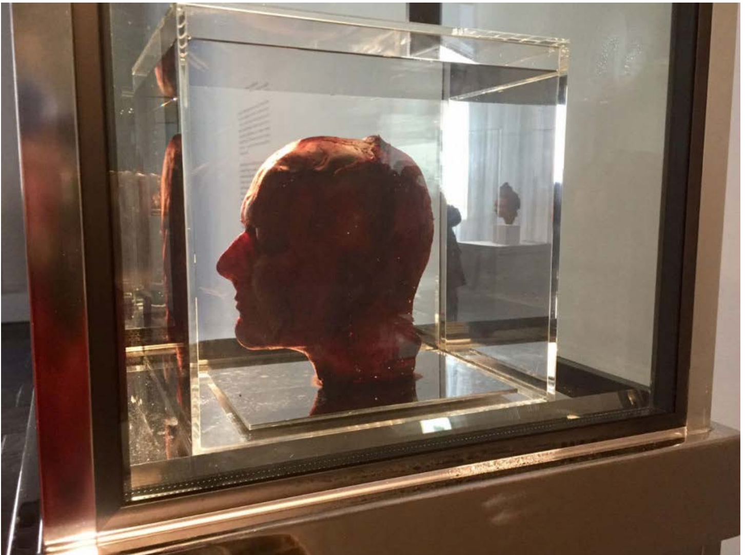
Marc Quinn, Self (1991).