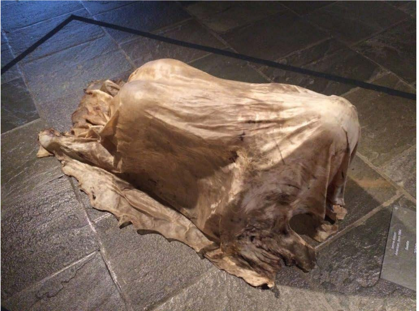
Janine Antoni, Saddle (2000).

Janine Antoni's evocative sculpture Saddle doesn't actually feature a figurative body; instead, it merely implies the presence of one. Antoni cast hardened rawhide over her own frame while she crouched on hands and knees. The freestanding sculpture depicts the outline of her body, but the interior of the work is hollow. The name of the piece and the use of animal hide suggests a dehumanizing act, as if she had been mounted like a horse. But the rumpled surface and hollowness underneath invites other possibilities, a person in hiding, perhaps, or enshrouded before burial.