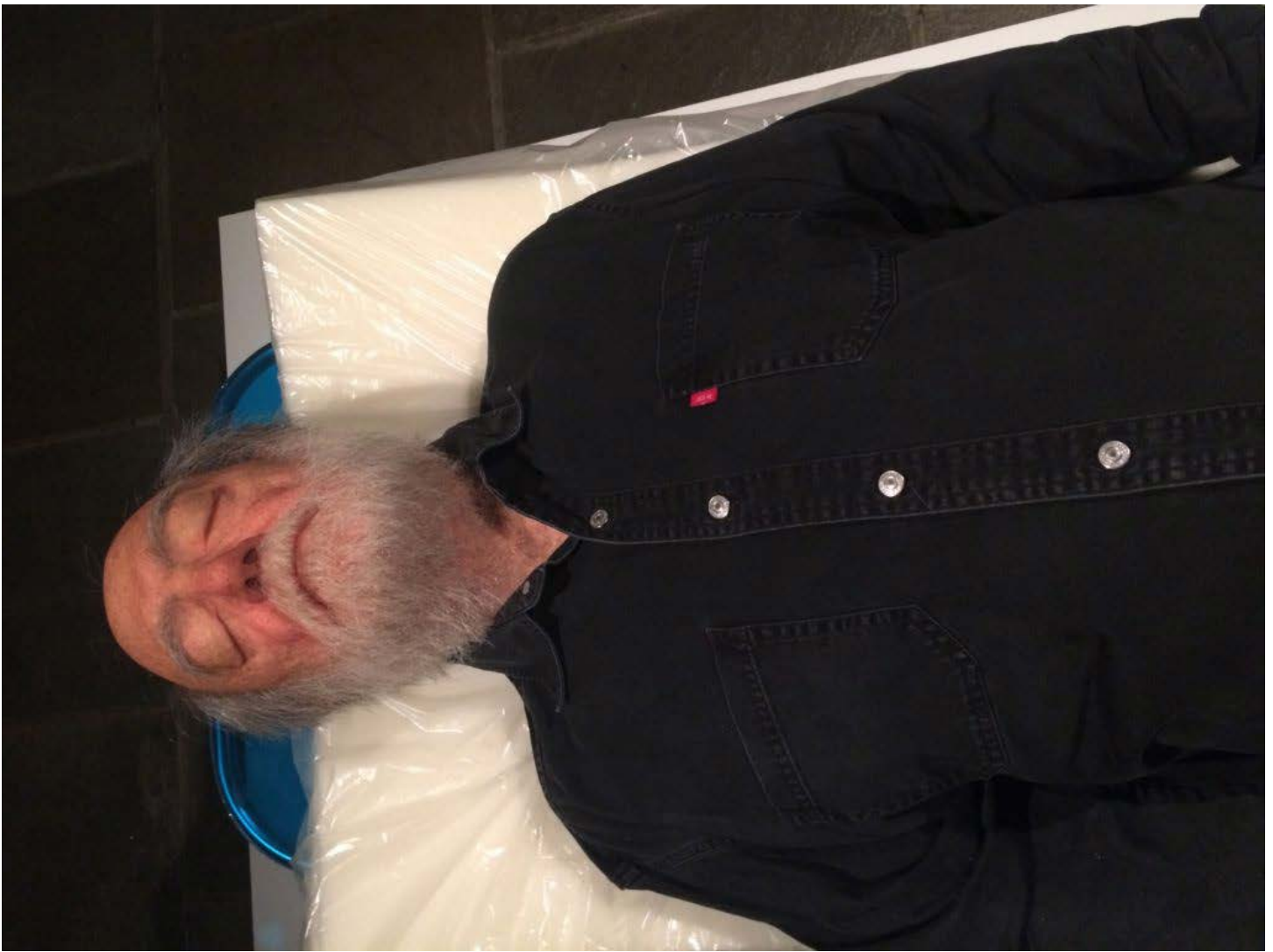
Paul McCarthy, Paul Dreaming, Vertical, Horizontal (2005-12).

In an exhibition of works pushing the uncanny, Paul McCarthy 's silicone cast of his own person feels most realistic—so much so, in fact, that one is almost wary in getting close to it, afraid that the figure could open its eyes at any moment. McCarthy first created the self-portrait in 2005, intending for it to serve as a prop for a film. However, he ultimately decided to present the sculpture as a work unto itself, posing the pants-less figure prostrate on a cheap lawn chair. Many of McCarthy's works tap into the absurd, the gross, or the just plain weird, but Paul Dreaming , in its exacting replication of the 60-year-old artist's body, reads as a portrait of a man reconciling himself with the decay of his body, and confronting his own mortality.