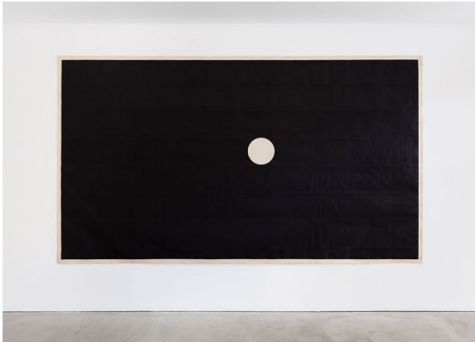
Marsha Cottrell, The Deliciousness of Staying Still , 2015. Laser toner on collaged paper, unique 81 x 142 ½ inches.

From MoMA's "The Forever Now" to the New Museum's "Surround Audience," curators are twisting in knots over the digitalization of contemporary art. More conceptually penetrating and gorgeous than anything in either show are Marsha Cottrell's unique handmade digital prints at 11 Rivington. Since 1998 she has been probing the interface between computer and ink, treating electrostatic toner as a rich, primordial mezzotint, and taking a devil's advocate approach to the machines and programs under her intimate control.